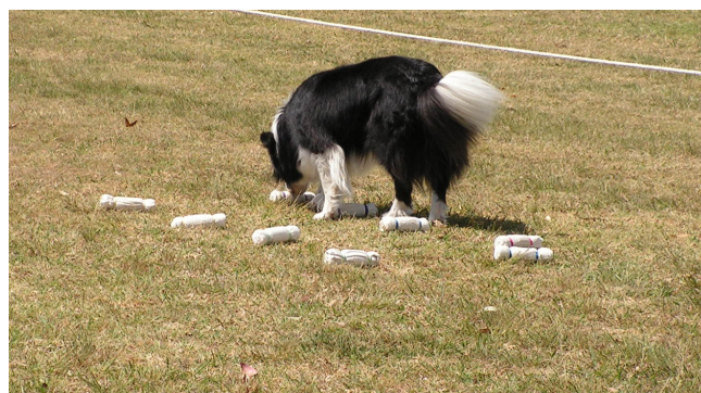
Scent discrimination underway in the UDX ring at the trial